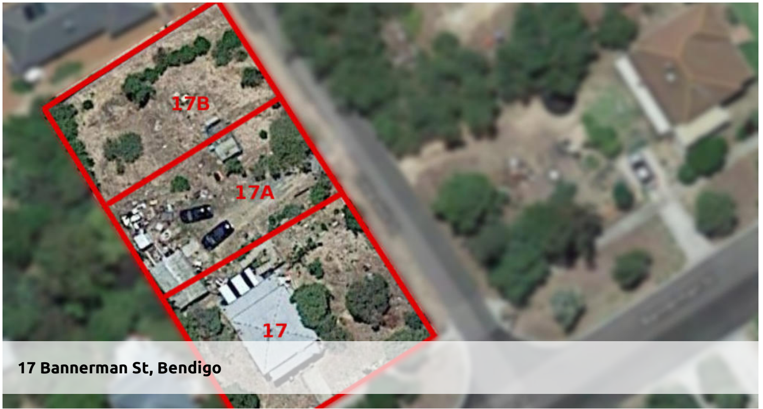
17 Bannerman St, Bendigo